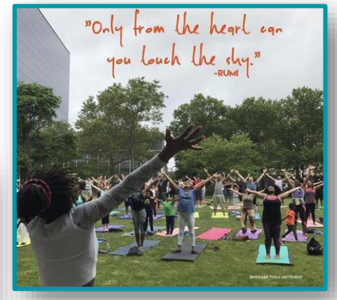
"Only from the heart can you touch the sky." -Rumi

"Your don't have to try to meditate. You just do."